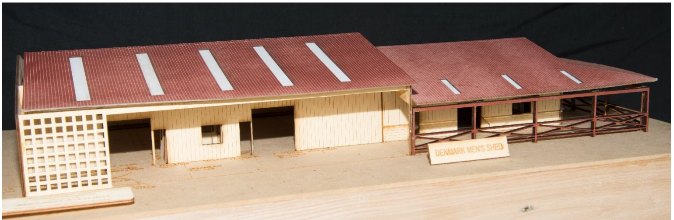
Model of the proposed new shed.