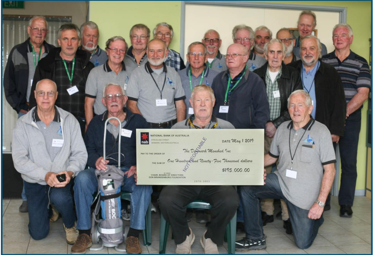
Presentation of $195,000 grant from the Don Brandenburg Foundation – May 2019